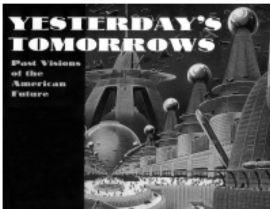
"Yesterday's Tomorrows: Past Visions of the American Future" toured Nebraska in 2003.

The NHC has collaborated with NETV over the years to bring a variety of programs to Nebraska on our history and culture, including "Next Exit," "If These Walls Could Speak" and "Bethsaida."