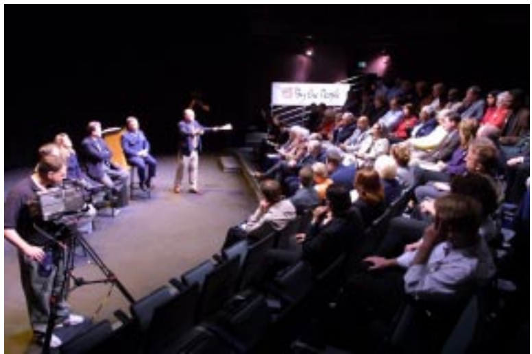
Nebraska Public Television tapes "By the People" discussion.

With council grants, El Museo Latino in Omaha has brought exhibits on pottery from Mata Ortiz, Mexico, photography and woven arts from South America, and speakers from all over Latin America. The Nebraska State Historical Society and the NHC have collaborated on numerous projects, includ-