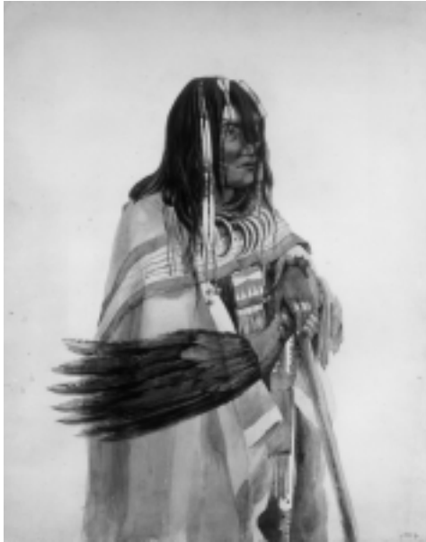
Makuie-Poka, Piegan Blackfeet Man (“Child of the Wolf”). Joslyn Art Museum, Omaha, Nebraska; Gift of Enron Art Foundation.

Pause and think about what the century from the 1730s to the 1830s witnessed in the movement of human actors across the Great Plains stage—the Lakota Sioux expanding steadily from east to west; the shifting locations of Arikara, Mandan and Hidatsa village farmers; the trading visits to those village farmers made by Assiniboine, Cheyenne, Arapahoe and Crow traders; the raiding adventures made by Hidatsas, including the one that scooped up the young woman who became Sacagawea. Then add in the European traders coming down from Canada and up from St. Louis.