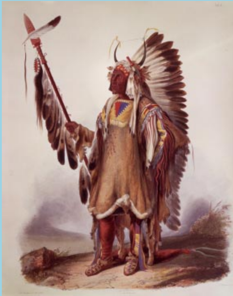
“Mato-Tope, a Mandan Chief,” by Karl Bodmer. Joslyn Art Museum, Omaha, Nebraska.